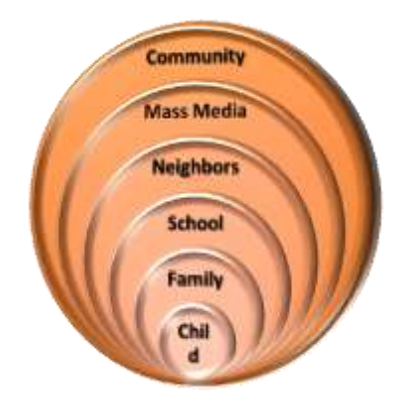
Diagram of Microsystem

The children learn about the society in the school which is the second setting of development of the child. It is the structural form of the socialization where teachers are models, managers and motivators for encouraging the child to adapt various skills and behaviours.